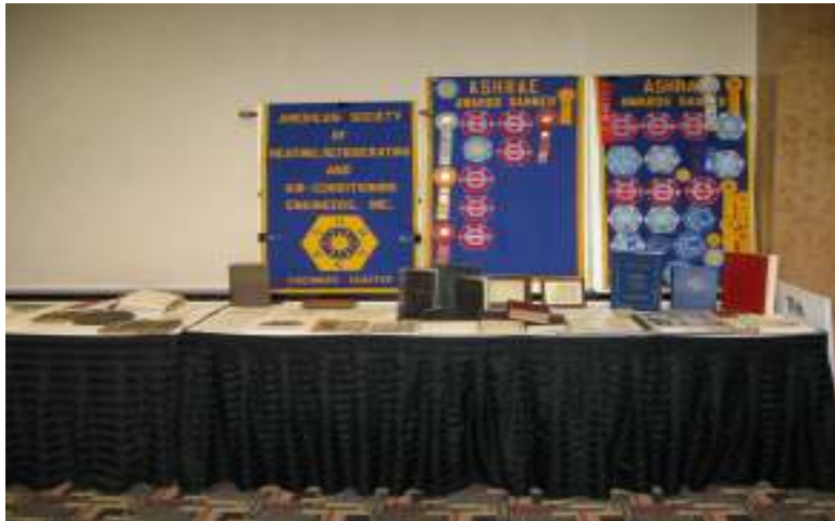
(Cincinnati ASHARE Chapter History Table)

A monthly publication of the Cincinnati Chapter of the American Society of Heating, Refrigeration & Air Conditioning Engineers